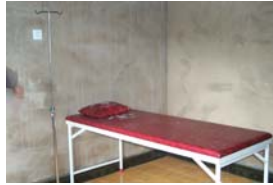
As the clinic building has just been completed, Dr. Sun has just begun set up the examination table and the cupboards to store supplies.